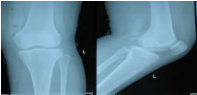
Figure 1: Knee X-ray of the patient, there is no abnormality of the bone.

A 17-year-old male presented to our clinic with right knee pain. It is especially exacerbated with squatting. His physical examination was not specific for any kind of injuries. MRI examination revealed lobulated cystic lesion on the PCL. The reported symptomatic relief after 4 weeks of bracing and rest.