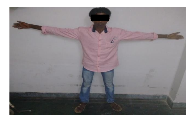
Figure 1: Abnormally long arm span.

On physical examination, body weight, height and arm length were 48 kg, 171 cm, 171 cm respectively. Vital parameters were within normal range. His facial appearance showed oblong face, epicanthal folds, hypoplasia of cheeks, high arched palate suggestive of Marfanoid features certified by physician.