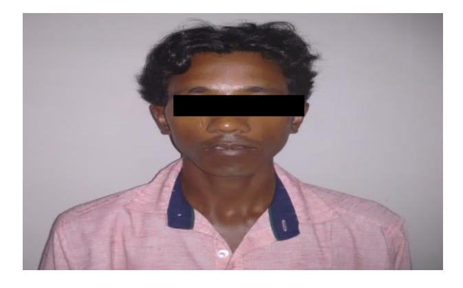
Figure 2: Narrow long Face with long neck.