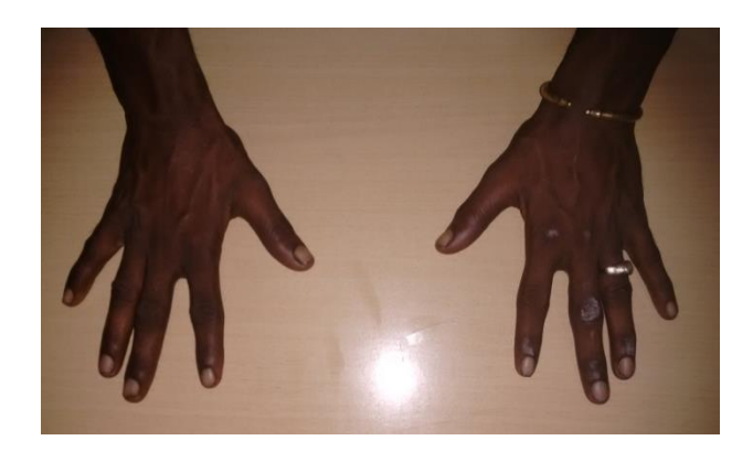
Figure 4: Abnormally long fingers.

eye persistent pupillary membrane, iridodonesis with inferonasal subluxated lens with few zonules holding lens in position with poor response to dilating drops. RE shows nuclear cataract grade III with iridodonesis with funnel shaped configuration of iris due to subluxation of lens posteriorly. His both eyes fundus were highly myopic with multiple lattices inferiorly and in supralateral quadrant with holes in periphery.