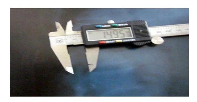
Figure 1: Photographs showing measurements of A-P. diameter of the vertebral canal on the radiograph with vernier calipers.