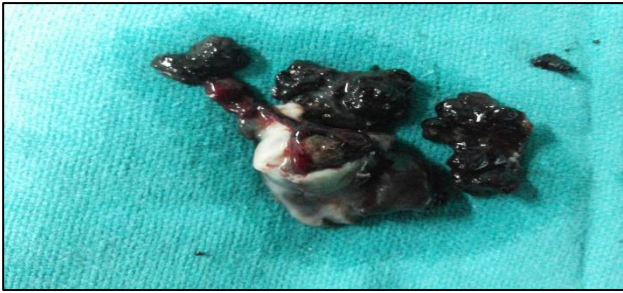
Figure 1: Gross photograph showing grey white to brownish black soft, friable polypoidal mass.