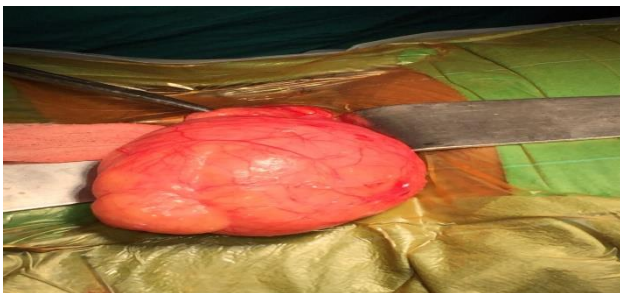
Figure 2: Intra-operative photograph as the hernia sac is delivered out intact.

A right groin transverse incision was taken. Content of the direct sac was identified as the urinary bladder (Figure 2). Bladder was reduced and 3D mesh placed after creating a plane in the pre peritoneal space. Postoperative period was uneventful.