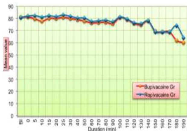
Figure 1: Pulse rate at various time interval among study group.

Pearson Chi Square-0.197; Fisher’s exact test-0.333.