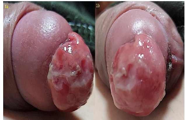
Figure 1: (a) and (b) A fleshy red, well-defined, smooth, shiny, rounded, sessile, polypoidal growth of size 3.5×3 cm present circumferentially around the urethral opening on the glans penis.

Little is known regarding the occurrence of PG in the glans penis. PG on the glans penis is rare in pediatric age group, only few cases have been reported. 2,3 It may also develop after circumcision. PG often develops an eroded surface, with subsequent bleeding which can be profuse. Early treatment is required as it may grow rapidly and often undergoes ulceration. Surgeons should be careful while doing the procedure including the instrumentation and even catheterisation to minimize trauma. Simple curettage with electrocautery is usually curative in small lesion. Other options include excision, laser surgery (carbon dioxide or pulsed-dye laser), and cryotherapy. Imiquimod and timolol have been suggested as effective topical treatment options. 1