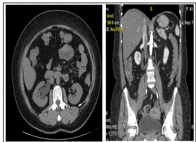
Figure 1: Abdominopelvic CT scan. Moderate-severe right hydronephrosis with the presence of a right ureteral stenotic retrocaval ringlet in the upper third of the ureter.

The patient evolved satisfactorily, showed no signs of inflammatory systemic response and continued under post-surgical surveillance until drainage was removed, with progressively diminished serohematic output. Ureteral catheter was removed after 6 weeks.