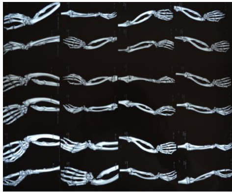
Figure 16: The CT showing mesomelic type of shortening with madelung deformity of the right upper limb.

The CT of right hand and wrist revealed radial shortening in relation to underdeveloped ulna with carpal wedging, V formation of proximal carpal bones. The growth plate of distal ulna and radius were not fused. Also there were seven carpal bones visualized with non-formation of pisiform bone. Confirming the mesomelic type of shortening with madelung deformity of the right upper limb (Figure 16). The AP X-ray of knee showed irregularities of bony chondral interface of the medial fibial shoulder including foci of inhomogeneous ossification. An osteocartilageneous protuberance was seen in relation to medial aspect of right tibia (Figure 17). The right femur AP radiographs showed an osteoblastic lesion just below the lateral condylar region which is extra-articular (in the epiphysis and tuberosity region) (Figure 18). The chest X-ray of the patient appeared normal (Figure 19). The standard laboratory blood parameters (blood count, coagulation, electrolytes, kidney function tests, liver function tests and thyroid function tests) were all within the normal range.