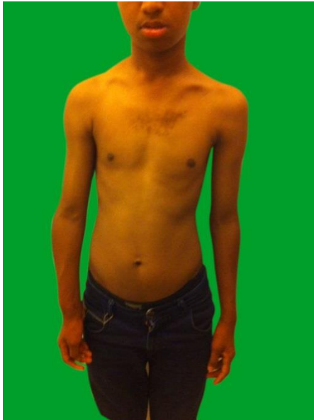
Figure 6: Limb length discrepancy in relation to left third toe.