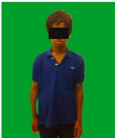
Figure 2: Disproportionate skeletal growth on comparison with right and left upper limb of the patient.