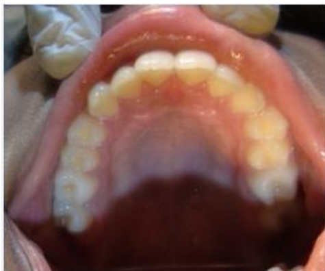
Figure 7: A diffuse greyish blue pigmentation was seen on the palate which is symmetrical around the midpalatine raphae.

A diffuse greyish blue pigmentation was seen on the palate, roughly oval in shape with diffuse borders, extending from 1 cm below the incisive papilla to 1 cm from the junction of hard and soft palate. Medio laterally, it is symmetrical around the midpalatine raphae (Figure 7).