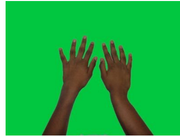
Figure 3: Mesomelic type shortening of right upper limb with apparently normal left upper limb.

On physical examination, a painless and hard protruded mass could be palpated on the dorsomedial aspect of the right ankle region. There were no sinuses, skin changes or bruit over the swelling (Figure 4). Another painless and hard protruded mass could be palpated on the dorsomedial aspect of the right tibial region (Figure 5). There was limb length discrepancy in relation to left third toe (Figure 6).