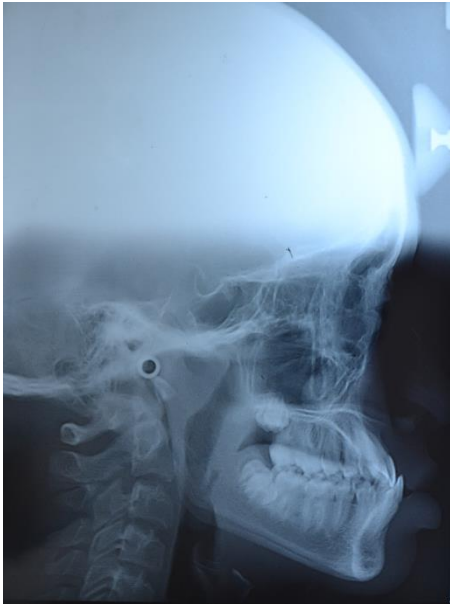
Figure 12: The lateral cephalometry of the patient showing mandibular deficiency.

The PA view of the patient showed facial asymmetry in relation to left half of the face (Figure 13). To confirm, Grummon's analysis was done on PA view, which showed that dental midline was shifted towards right side and skeletal midline was shifted towards left side of the patient. Also there was a shift in the cant of occlusal plane towards left side suggestive of both skeletal and dental asymmetry (Figure 14).