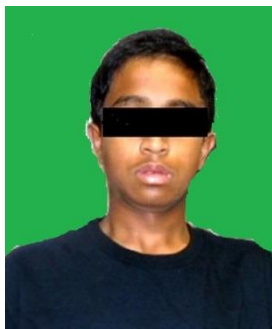
Figure 1: Frontal profile picture of the patient.

A 14 year old Male patient reported to the department of oral medicine and radiology, with a chief complaint of forwardly placed lower jaw since childhood. His main concerns were difficulty in mastication and his appearance; hence he visited the dental OPD for treatment. The patient gave a medical history of deformity of right hand and was able to get only limited range of motion. Past dental history was not significant. After taking a brief family history he revealed that his great grandfather was a dwarf and his parents were apparently normal. On general physical examination, we noticed that there is disproportionate skeletal growth on comparison with right and left upper limb of the patient. We noticed a mesomelic type shortening of right upper limb. The left upper limb was apparently normal (Figure 1, 2 and 3).