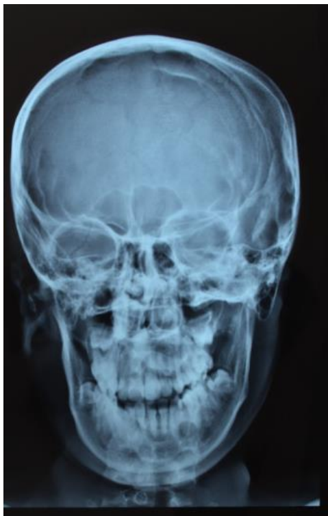
Figure 13: The PA view of the patient showing facial asymmetry in relation to left half of the face.

The PA view of the patient showed facial asymmetry in relation to left half of the face (Figure 13). To confirm, Grummon's analysis was done on PA view, which showed that dental midline was shifted towards right side and skeletal midline was shifted towards left side of the patient. Also there was a shift in the cant of occlusal plane towards left side suggestive of both skeletal and dental asymmetry (Figure 14).