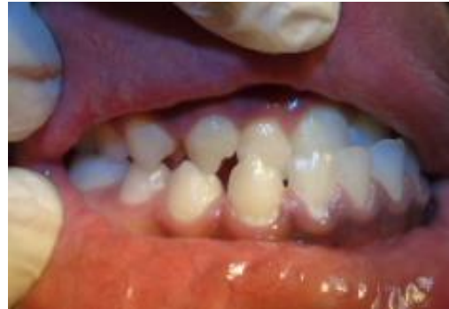
Figure 8: Class III malocclusion on right side.

Radiographs were advised for the patient. His OPG showed multiple impacted teeth in relation to 13, 14, 15, 23, 25 and 45 (Figure 11). The lateral cephalometry of the patient was taken and it showed mandibular deficiency (Figure 12).