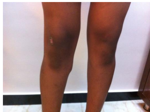
Figure 5: Painless and hard protruded mass could be palpated on the dorsomedial aspect of the right tibial region.