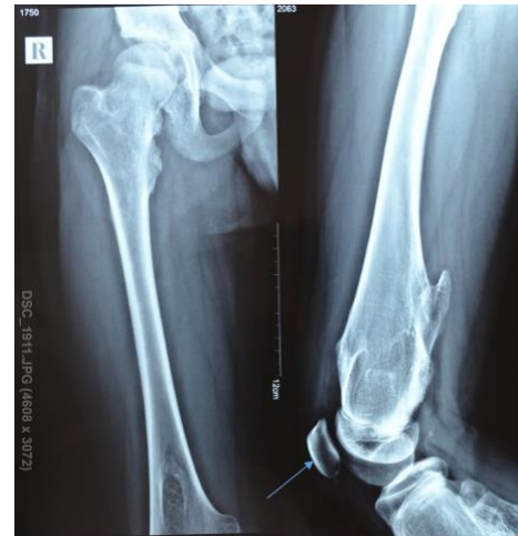
Figure 18: The right femur AP radiographs showing an osteoblastic lesion just below the lateral condylar region which is extra-articular (in the epiphysis and tuberosity region).