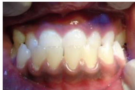
Figure 10: Retrognathic maxilla with Class III malocclusion.