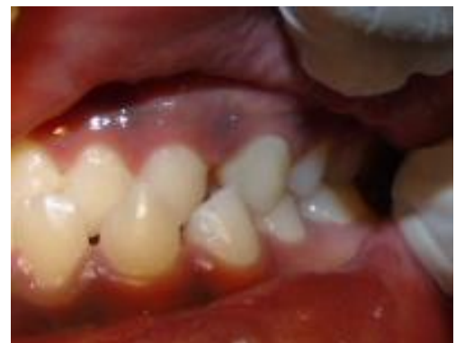
Figure 9: Class III malocclusion on left side.