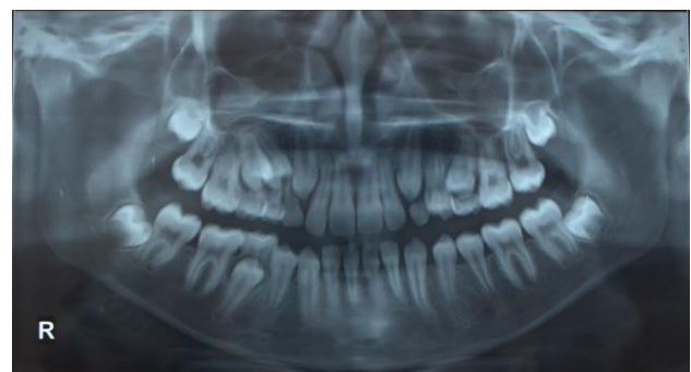
Figure 11: Patient's OPG showing multiple impacted teeth in relation to 13, 14, 15, 23, 25 and 45.