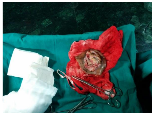
Figure 4: Specimen sent for Histopathology.