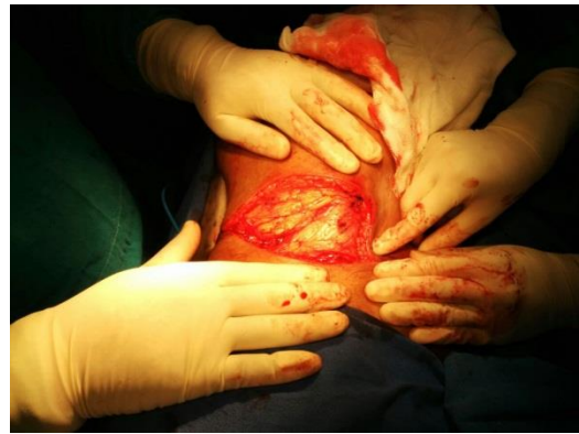
Figure 3: After wide excision of SCC.