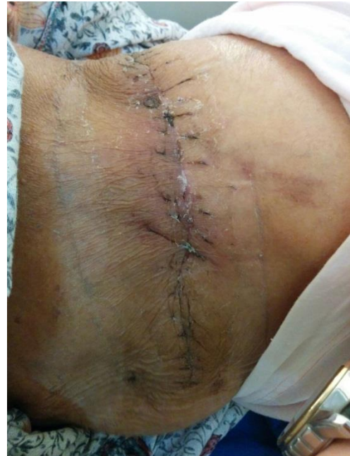
Figure 5: 3 week post op.