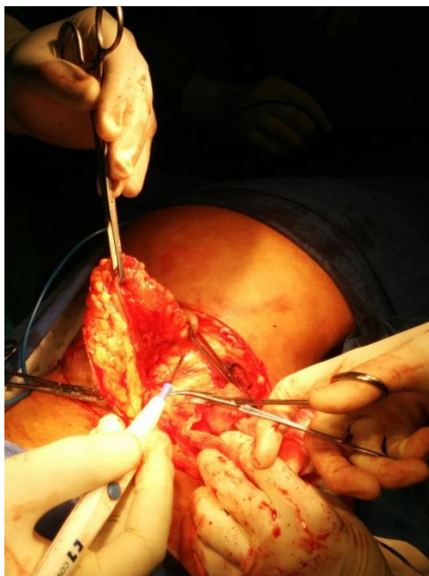
Figure 2: Intra Operative image.