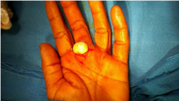
Figure 2: One of the epidermoid cyst being excised.