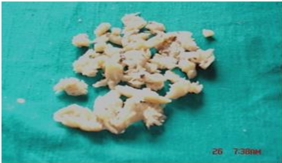
Figure 1: Grossly tumor was in multiple bits and totally measured 3.7x3x1.2 cm. Cut surface of tumor was solid, greyish white glistening with no areas of haemorrhage or necrosis.

immunohistochemistry the diagnosis of solitary fibrous tumor was rendered.