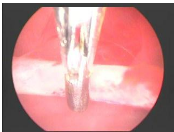
Figure 2: Hysteroscopic removal of foreign body.