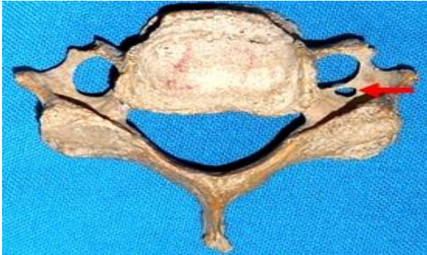
Figure 4: A typical cervical vertebra from the superior aspect. Arrow pointing at unilateral complete accessory FT on the right side.

and 3 (2.2%) on the right side (Figure 3 and 4). Bilateral incomplete accessory FT was seen in 6 (4.5%) of the total number of typical cervical vertebrae (Figure 5).