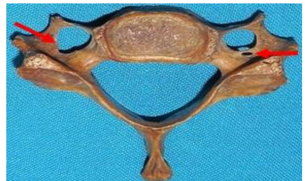
Figure 9: Superior aspect of typical cervical vertebra showing presence of incomplete accessory FT on the left side and complete accessory FT on the right side.