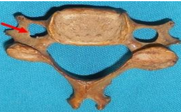
Figure 6: Arrow pointing at left sided incomplete accessory FT in a typical cervical vertebra as seen from the superior aspect.