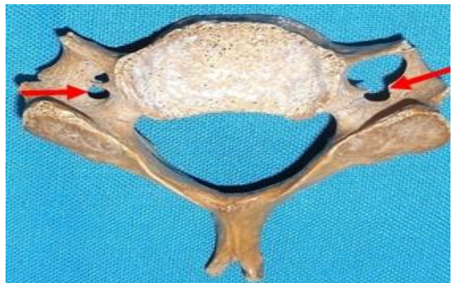
Figure 8: Superior aspect of typical cervical vertebra showing presence of complete accessory FT on the left side and incomplete accessory FT on the right side.

In the same typical cervical vertebra, 6 (4.5%) vertebrae showed presence of complete accessory FT on one side and incomplete accessory FT on the other side. Two (1.5%) vertebrae had complete accessory FT on left side and an incomplete on right side (Figure 8) and 4 (2.9%) vertebrae had incomplete accessory FT on left side while complete on right side (Figure 9).