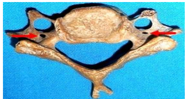
Figure 2: Superior aspect of typical cervical vertebra showing arrows pointing at complete accessory FT present bilaterally.