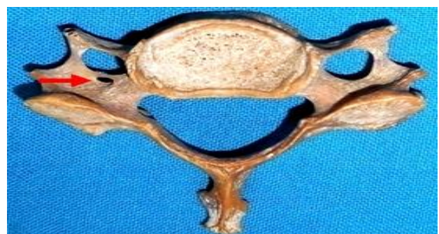
Figure 3: A typical cervical vertebra from the superior aspect. Arrow pointing at left sided unilateral complete accessory FT.

Out of the total typical cervical vertebrae (134) examined, 9 (6.7%) of them showed presence of unilateral complete accessory FT. Six (4.5%) were present on the left side