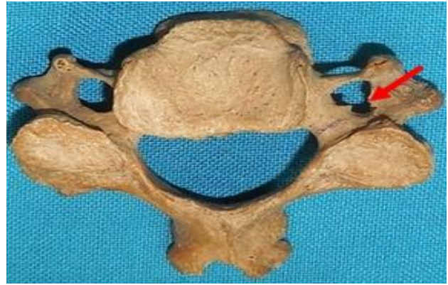
Figure 7: Arrow pointing at right sided incomplete accessory FT in a typical cervical vertebra as seen from the superior aspect.

In the same typical cervical vertebra, 6 (4.5%) vertebrae showed presence of complete accessory FT on one side and incomplete accessory FT on the other side. Two (1.5%) vertebrae had complete accessory FT on left side and an incomplete on right side (Figure 8) and 4 (2.9%) vertebrae had incomplete accessory FT on left side while complete on right side (Figure 9).