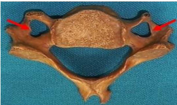
Figure 5: Superior aspect of a typical cervical vertebra. Arrows pointing at incomplete accessory FT present bilaterally.

Unilateral incomplete accessory FT was observed only in 12 (8.9%) typical cervical vertebrae. Out of this, 9 (6.7%) typical cervical vertebrae had unilateral incomplete accessory FT on the left side (Figure 6) and 3 (2.2%) on the right side (Figure 7).