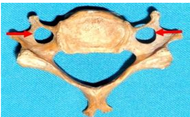
Figure 1: Superior aspect of normal typical cervical vertebra showing arrows pointing at foramen transversarium (FT).

Out of the 241 cervical vertebrae which included typical and atypical cervical vertebrae, presence of accessory FT was noted in typical cervical vertebrae only. Therefore only 134 typical cervical vertebrae were considered. Out of this 97 typical cervical vertebrae showed normal FT (Figure 1).