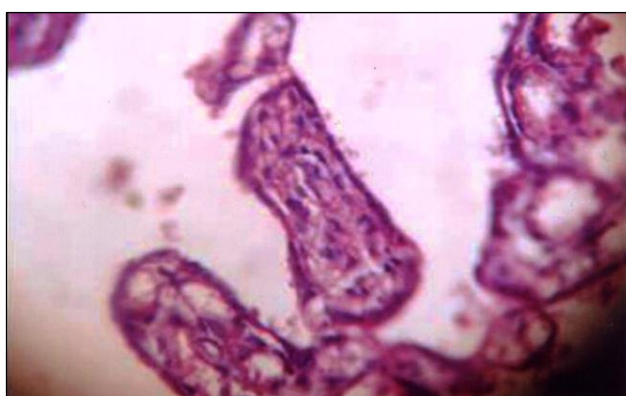
Figure 1: Cytotrophoblastic proliferation.