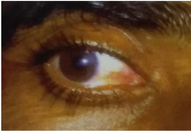
Figure 1: Conjunctival autograft with fibrin glue at 1 year post-operative showing no recurrence.