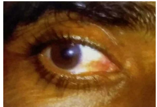
Figure 4: Glueless, sutureless conjunctival autograft at 6 months showing recurrence.

The fleshy, mobile vascular bulbar conjunctiva behind the head is known as body or tail. Patient is usually asymptomatic except cosmetic disfigurement but may present with redness, irritation, foreign body sensations, watering, dryness, itching and decrease vision due to astigmatism or involvement of pupillary area. Large lesion may cause diplopia, mostly in lateral zone due to tethering effect. This is more common in recurrent pterygium with scar tissue formation. Pterygium may be primary or recurrent following regrowth after excision. It has two stages. In progressive stage, it is thick and vascular and continue to grow on cornea. In atrophic stage, it is thin, pale and ceases to grow. Etiology of pterygium is uncertain. The features indicative of both degenerative process and disordered growth. Histopathologically the pterygium is elastotic degeneration of conjunctiva. 8 Pterygium also shows tumour like features. These are tendency to invade normal tissue, high recurrence rate following resection, ultraviolet radiation exposure as an etiology and may have secondary premalignant features. Chronic UV light