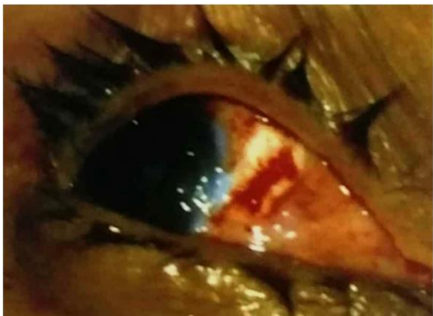
Figure 2: Conjunctival autograft with fibrin glue at 1 st day post-operative showing dislodged graft.