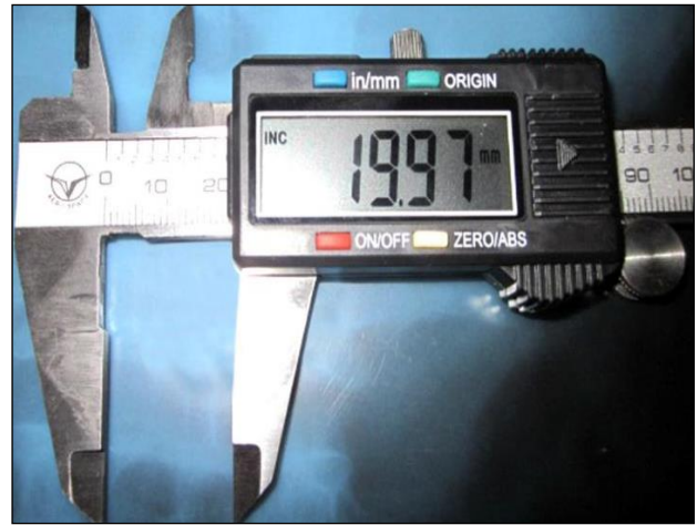
Figure 1: Measurement of interpedicular distance from digital Vernier caliper.

made by using electronic digital Vernier Calipers and were recorded to the nearest hundredth of millimeters keeping in view the aims of the study (Figure 1).