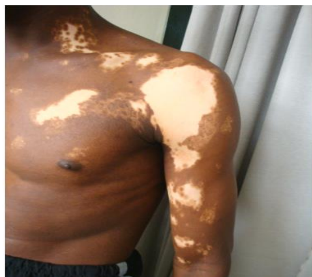
Figure 3: Segmental vitiligo.