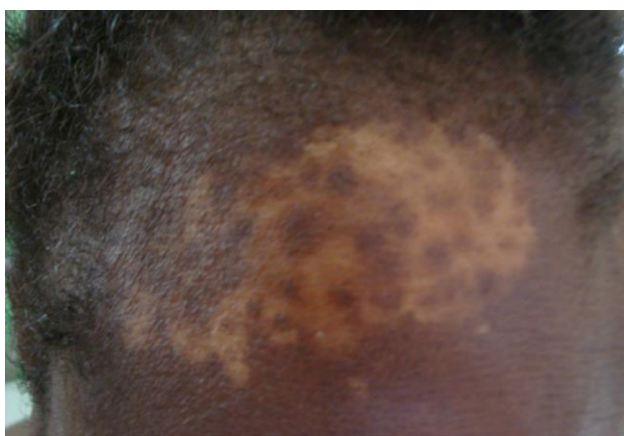
Figure 4: Vitiligo re-pigmenting.

The commonest type of vitiligo was acrofacial followed by vulgaris (Figures 2 and 3). However, in men the commonest type was vulgaris while segmental and acrofacial occurred equally in females. The commonest area of onset was the face/scalp with only females having the genitals as area of onset. Re-pigmentation following