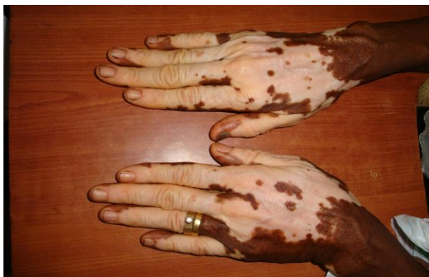
Figure 2: Acral vitiligo.