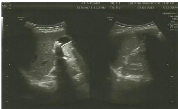
Figure 1: Ultra sound abdomen.