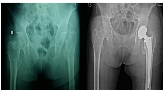
Figure 2: Radiographs of the pelvis AP view showing preoperative and postoperative neglected fracture neck of femur in a female patient aged 65 years.

Patients with more than three years follow up were included in the study. Patients with poor mental condition, pathological fracture, rheumatoid arthritis and those of ASA grade V are not managed using monoblock cemented hemiarthroplasty in our centre. All the operations were performed by the senior author (SK) using a modified Hardinge anterolateral approach with the patient in the lateral decubitus position. After preparation of the femoral canal (reaming, cleaning and drying) a distal restrictor (Harding's) was first inserted at appropriate depth followed by application of low viscosity cement. Proximal seal was used to pressurize the cement in the canal. Patients were mobilized from the next day with crutches or walking frame. After six weeks they were permitted to mobilize without further restriction.