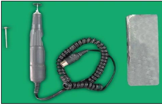
Figure 1: Armamentarium for preparation of ground section of tooth.