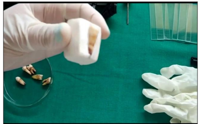
Figure 3: Mounting tooth for preparation of ground section of tooth.