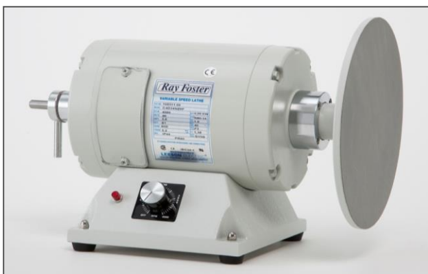
Figure 2: Armamentarium for ground section of tooth.