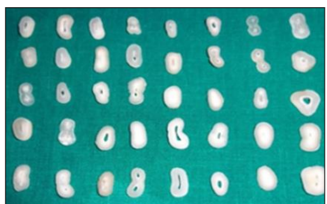
Figure 4: Horizontal ground sections of teeth.