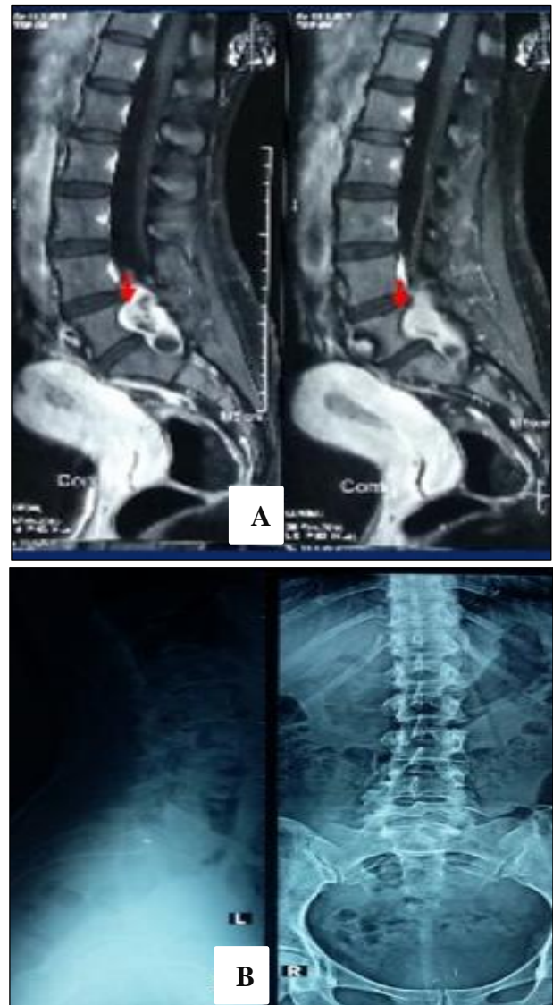
Figure 1 A): Lumbo-sacral MRI with contrast. B): Lumbo-sacral plain X-ray AP-lateral view.

Thoracolumbar x-ray shows straight lumbosacral, chronic indentation, pedicle thinning. MRI shows hyperintense of L5 and S1 and extend to outside lateral foramen. Shape is dumbly-bell, cystic, multilocular, invading wall and septum, intracystic component is hypo intensely in T1W1, hyperintense in T2W1, recess in left lateral and neural foramen at L4-L5, L5-S1.