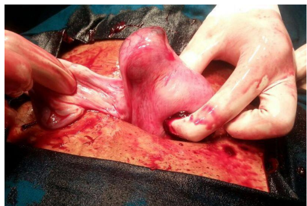
Figure 3: Right sided cornual pregnancy.