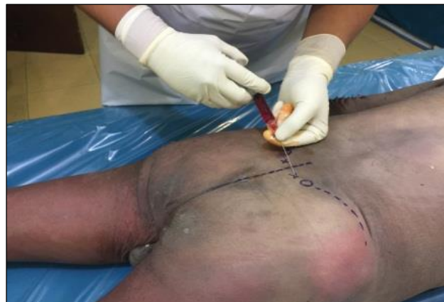
Figure 2: Operator 1.