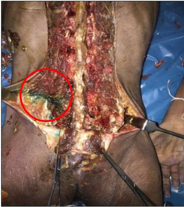
Figure 4: Example of the successful injection through the SIJ.