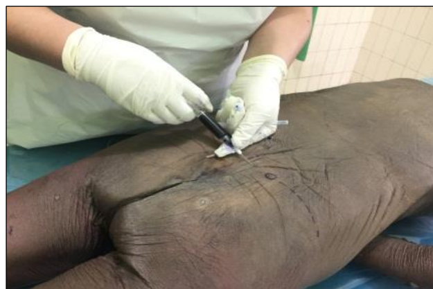
Figure 3: Operator 2.