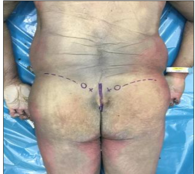
Figure 1: Injection landmark.