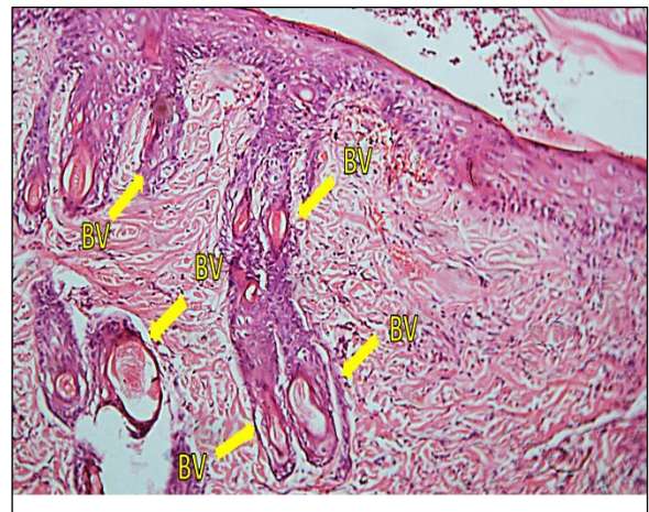
Figure 2: Bar chart showing comparison of number of blood vessels between A, B and C Groups on 3 rd and 7 th day of treatment.