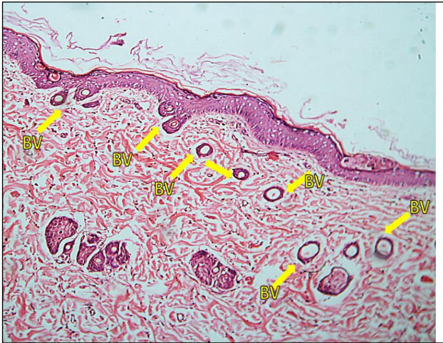
Figure 4: Skin tissue (H&E staining) showing decrease number of blood vessels in group C (Streptococcus Thermophilus) (BV-Blood Vessels).

Number of blood vessels under (x400) were observed and mean±SD of group A(1) was 2.6625±0.63682, A(2) 4.1875±0.24749. In C(1) was 8.4875±0.19594, C(2) 11.9750±0.31053. A statistically significant difference was observed with p value of A(1) vs C(1) (p=0.01), A(2) vs C(2) (p=0.02). Results showed significant increase in no: of new blood vessel formation in Group C in comparison with group A as shown in figure 1 and figure 2 and 4.