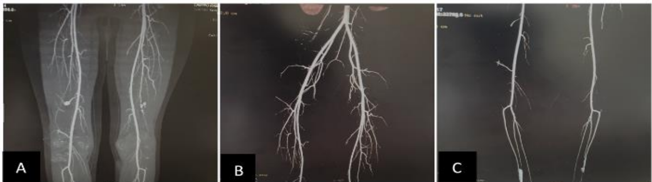
Figure 2: Angiotomography. (A). Angiotomography with coronal plane reconstruction where there is an increase in the density and heterogeneity of the soft tissues adjacent to the knee joint. Vascular structures with path and gauge in normality. There are images that could suggest vascular curls in the middle third of both superficial femoral arteries. (B and C). Traditional reconstruction in coronal plane with vascular structures in normal trajectory and caliber, without filling defects, with adequate repletion.