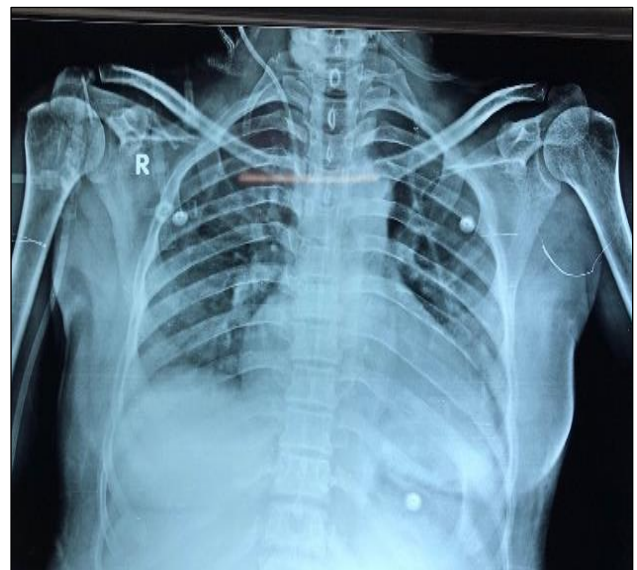
Figure 3: Chest X-ray PA view cardiac enlargement and pulmonary oedema.