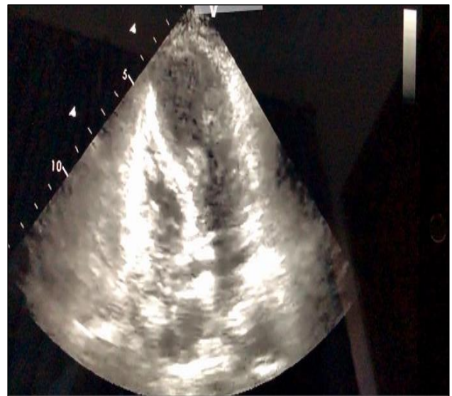
Figure 2: Echocardiography showing apical ballooning.

Myoglobin: >500 ng/ ml (0.0 - 107 ng/ ml) proBNP: 2200 pg/ml (0.0 - 100 pg/ml) D-dimer: 1130 ng/ ml (0.0 - 400 ng/ ml) Chest X-ray: Cardiomegaly with patchy opacification upper, mid and lower zones bilaterally suggestive of pulmonary edema (Figure 3). ECG: Sinus tachycardia, ventricular rate:147 per minute, q wave in L2, L3,V1,V2,V3,V4, ECHO: Apical ballooning, with left ventricular dysfunction, dilated inferior vena cava Coronary angiogram: Normal epicardial vessels Left ventricular ejection fraction: 14-08-18 : 31%, 16-08-18 :40%, 18-08-18 : 53%, 22-08-18:65%