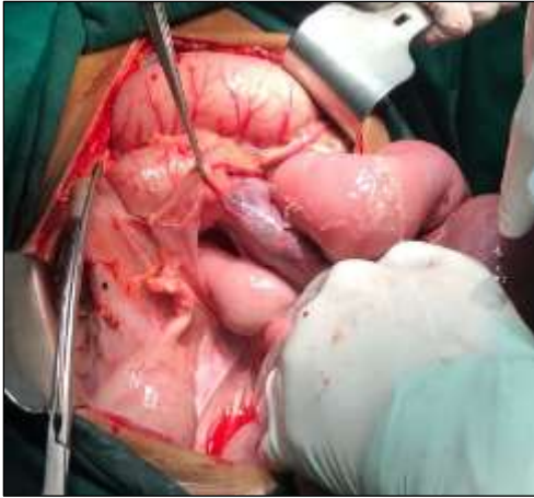
Figure 5: We found internal hernia in right lower quadrant and there was a Ladd's band.

During operation time, his hemodynamic unstable because of the septic state. That was forcing us to resect of necrotic part and performed double barrel ileostomy.