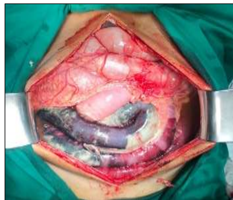
Figure 4: About 110 cm segment of ileum necrotic, the rest of the small bowel was normal.