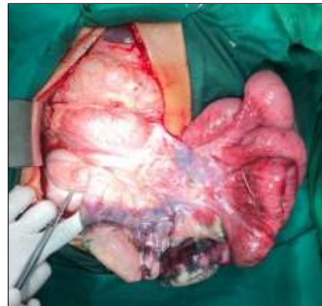
Figure 3: The ligament of Treitz misplaced, there was in the right lower quadrant, close by ICJ, slightly extended and edematous.

Upon entering the abdomen, ileum was noted to completely mobilized and founded volvulus segment, a clockwise twisting three times, about 30 cm proximal from ICJ, and soon author released it (Figure 2). The ligament of Treitz misplaced, there was in the right lower quadrant, close by ICJ, slightly extended and edematous (Figure 3). Then about 110 cm segment of ileum necrotic, the rest of the small bowel was normal, author found internal hernia in right lower quadrant and there was Ladd's band (Figure 4) (Figure 5).