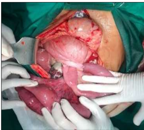
Figure 2: Ileum was noted to completely mobilized and founded volvulus segment, a clockwise twisting three times, about 30 cm proximal from ICJ.

Abdominal X-rays revealed dilatation of gastric, coiled spring appearance without free air on physical examination, the patient really weak and his mental state was somnolence, the patient's vital signs were pulse 108/min, blood pressure 100/70 mmHg, temperature 38.1 °C and respiratory rate 28/min. His abdomen was slightly