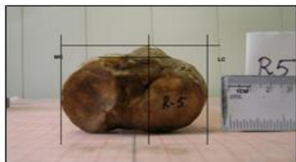
Figure 2: Analysis of the end on view photograph using adobe photoshop.

Analysis; A horizontal line was drawn touching the most prominent point of the TT. Then 3 vertical lines were drawn. The first line just touching the edge of the medial condyle, 2 nd line passing through the prominence of TT and the third line just touching the edge of the lateral condyle. In the above photograph the prominence of TT was also assessed by drawing a horizontal line across the base of the TT (Figure 2 and 3).