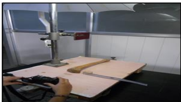
Figure 1: Method of taking end on view photograph of upper end of tibia.

The material for the present study comprised of one hundred and seventy adult human tibia bones. The tibias were collected from the department of Anatomy from various Medical colleges. Horizontal position was assessed using 2 digital photographs of the upper end of the tibia, one being end on view and the other frontal view. The picture thus taken was transferred to the computer and analysed using adobe photoshop version 5.0 software (Figure 1).