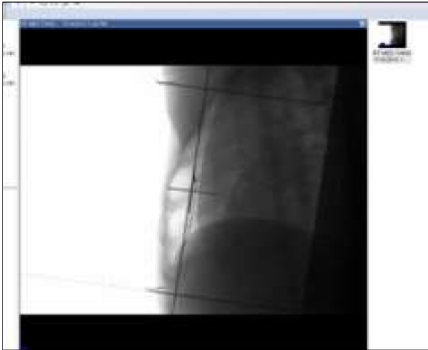
Figure 2: Central lung distance.

as shown in (Figure 2) by using the standard scale software on the treatment planning station (TPS).