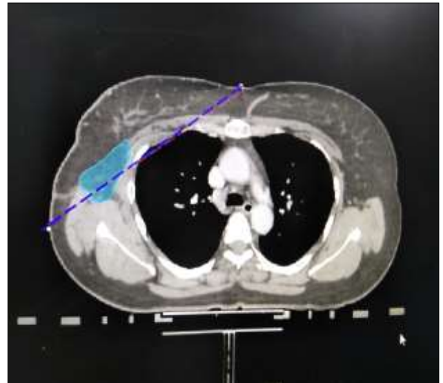
Figure 4: Axillary lymph node Level-I and position of the beam.

level I were shown in blue colour wash as shown in (Figure 4) and level II were marked by red colour wash as shown in (Figure 5). The serial of lines were drawn to assess the coverage of lymph nodes level I and II and measured as full, adequate, inadequate or nil. The superior border also identified whether covering level II adequately or not and information was recorded in a tabulated form.