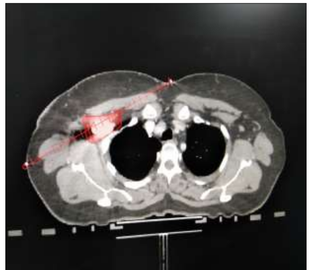
Figure 5: Axillary lymph node level-II and the position of the beam.