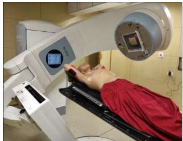
Figure 1: Planning on simulator with standard borders marked by fiducials.

Age of <20 and >70 years, KPS<70 and deranged hematological and biochemistry profile.