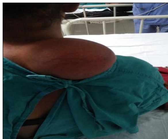
Figure 1: Giant epidermal cyst over the right upper back.

A 38-year-old female patient presented to the surgery department with the complain of a slowly growing painless swelling over the back at the right side for last 4 years. The swelling was about 1 cm in size when she first noticed and since then its growing slowly.