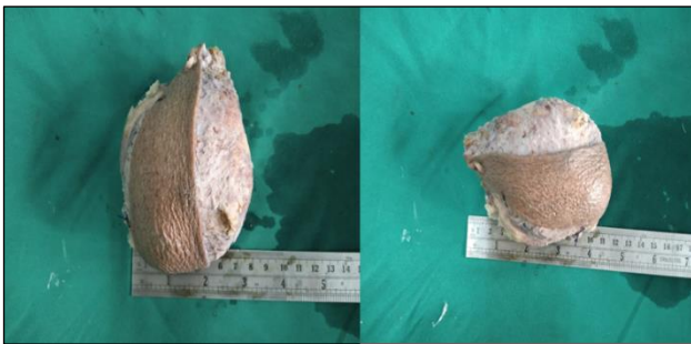
Figure 3: Surgical excision of the epidermal cyst that revealed well defined margins with elastic texture and contained a cream coloured fluid with butter like consistency.

There was no pain or discharge associated with the swelling. The swelling had gradually increased in size over past 1 year to attain the present size of 10 *10 * 6 cm.