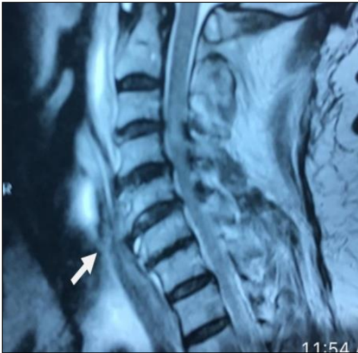
Figure 2: Fracture spinous process C4 vertebra.