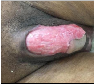
Figure 7: Debrided penis.