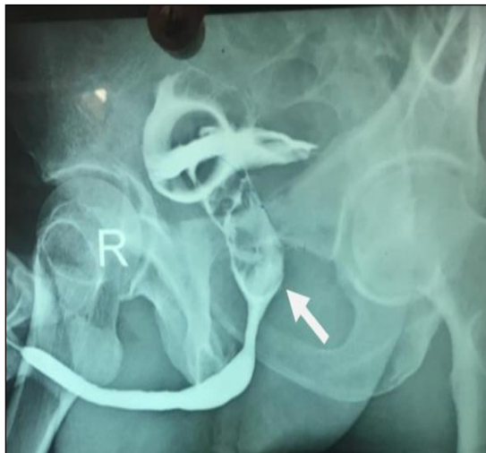
Figure 5: RGU showing catheter balloon inflated in urethra.

and tried to push the catheter in bladder but patient started sweating, became dysnoeic, had severe bradycardia and hypertensive crises. Immediately injection atropine was given intravenously and capsule nifedipine 10 mg was placed sublingually. There was sudden fall in blood pressure and patient had a cardiac arrest. Injection adrenaline and atropine given intravenously, and CPR started. Patient revived and oxygenated through venti mask. Managed conservatively with i.v antibiotics, antacids, analgesics and on stabilization SPC was done. Subsequently RGU was done which showed that catheter balloon was inflated in prostatic urethra (Figure 5). PUC was placed over guidewire and discharged on SPC and PUC (acting as a splint). He recovered almost completely with residual paresis in left lower limb (Power grade IV) and decreased touch sensations. PUC was removed after four weeks and repeat RGU was done which was normal. SPC was clamped after patient was ambulatory and subsequently removed.