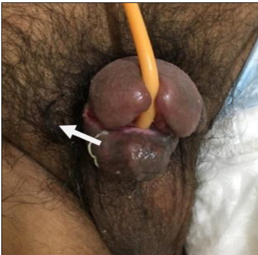
Figure 3: Ventral slit of urethra.