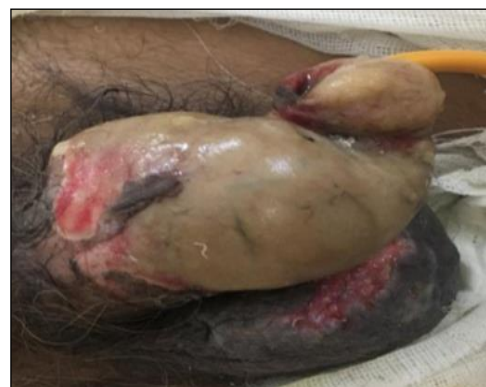
Figure 6: Catheter induced penile abscess.

A 62 years old male, a case of PIVD (L4-5) with diabetes mellitus who had developed weakness of both lower limbs and retention urine after a fall from height and was being managed in orthopedic department, was brought in urology OPD with a complaint of swelling of penis after change of per urethral catheter by community health professional few days back. On examination patient was on wheelchair, power in lower limbs was grade IV, febrile, penis was edematous, deformed with whitish look and there was ulceration over base of penis and anterior scrotum. Foleys catheter was in situ. Diagnosed as a case of uncontrolled diabetes mellitus with PIVD with catheter induced penile abscess (Figure 6). Patient was placed on i.v antibiotics, analgesics, antacids and regular insulin with serial monitoring of blood sugars. SPC along with incision and drainage of penile abscess done followed by subsequent debridement sessions. Patient responded, well, improved neurologically and shifted to plastic surgery department for grafting (Figure 7).