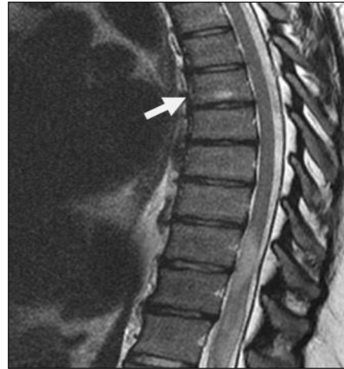
Figure 1: Transverse myelitis t6 vertebra.

catheter was dangling. Patient managed conservatively, TWOC was successful, postvoid residue was insignificant. Hypospadias repair was advised but patient lost to follow-up.