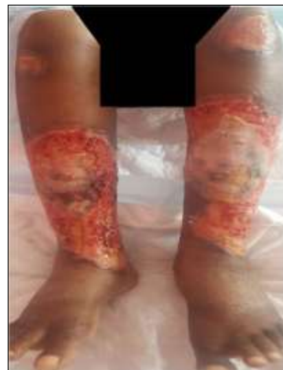
Figure 4: The PG case picture after 2 months of infliximab therapy. The ulcers over both knees almost healed with a marked bilateral improvement of the leg ulcers.

Therefore, the patient was shifted to IV infliximab 5 mg/kg in week 0, 2, 6, and then every 8 weeks together with prednisolone 0.5 mg/kg and regular wound dressing. After two months of treatment, the ulcers over both knees almost healed with a marked bilateral improvement of the leg ulcers (Figure 4).