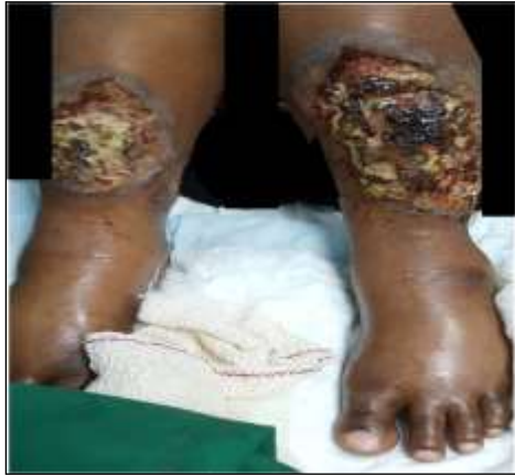
Figure 1: The PG case picture at presentation showing bilateral, symmetrical necrotic ulcers on the anterior aspect of both legs.

examination, there were bilateral, symmetrical necrotic ulcers on the anterior aspect of the legs measuring 15 cm x10 cm in diameter, with undermined violaceous borders, covered with hemorrhagic crust and sloughing with bilateral lower limb edema (Figure 1).