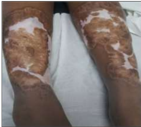
Figure 5: The PG case picture after one-year treatment with infliximab. The leg ulcers completely healed with residual pigmentation.

The patient continued on infliximab for one year, during which the leg ulcers completely healed with residual pigmentation (Figure 5).