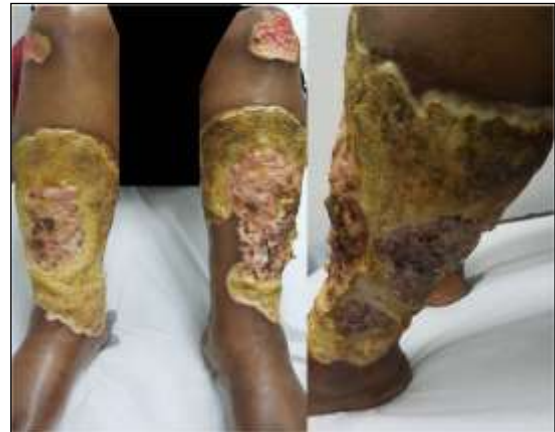
Figure 3: The PG case picture after 6 weeks of prednisolone and cyclosporine A therapy. The lesions increased in size, got infected, and became more extensive.

Multidisciplinary team management was initiated by dermatology, wound care, plastic surgery, endocrinology, and gastroenterology. Antipyretic, IV antibiotics, and wound dressing were immediately started. Then pulse therapy of corticosteroid for five days followed by oral prednisolone and cyclosporine-A were given for six weeks but did not show any improvement. Conversely, the lesions increased in size, got infected, and became more extensive (Figure 3).