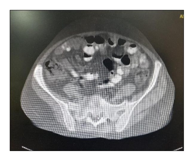
Figure 1: CECT abdomen it is well defined heterogeneously enhancing soft tissue lesion with erosion of sacral s2 and s3 region suggestive of metastases (arrow).

obstructive jaundice she was considered for internal stenting. As disease was unresectable, she was planned for Gemcitabine based palliative chemotherapy. After 6 cycles of chemotherapy response assessment CECT scan abdomen reported partial response. But in view of poor tolerance she was started oral capecitabine. After 6th cycle she complained of decreased sensation in perianal region and low back ache.