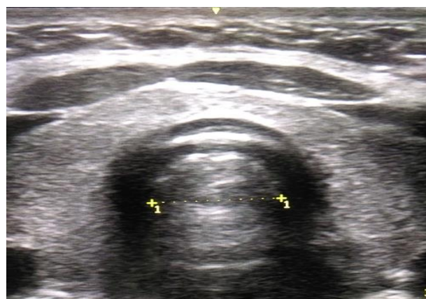
Figure 1: Ultrasound measurement of subglottic diameter of trachea.

endotracheal tube (teleflex) for our study. Corresponding inner diameter of the selected tubes were recorded. The endotracheal tube with an outer diameter always less than the measured tracheal diameter was selected to prevent trauma to the airways. These measurements were performed when manual ventilation was stopped briefly to minimize fluctuation in tracheal diameter. 8-11